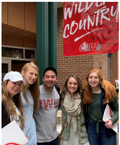
A community grant to Bridges 2 College helped Darke County students learn about the college admissions process and visit college campuses.