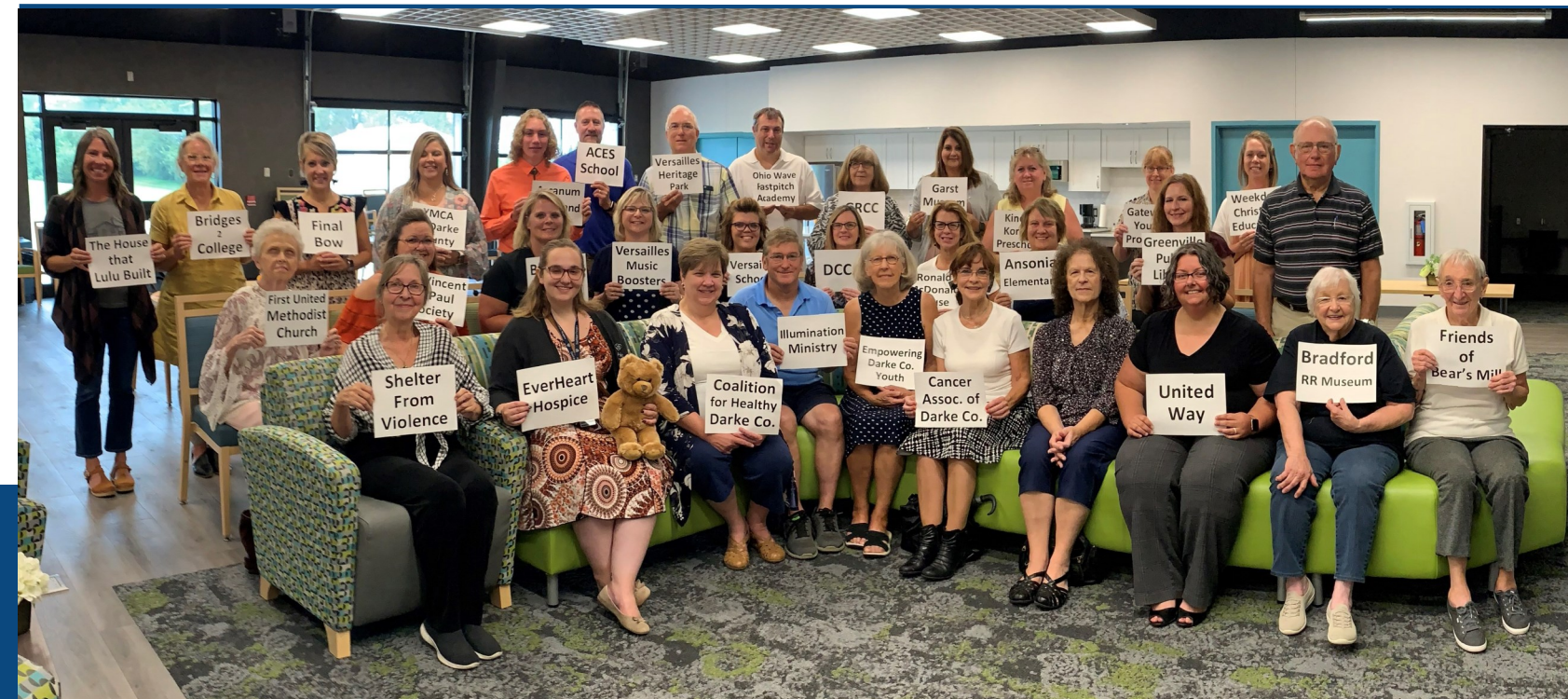
The Darke County Foundation recently awarded grants to non-profit organizations that serve Darke County residents. Pictured are representatives of organizations that gathered at Birchwood Training Center in Greenville to receive their grant checks.

The Darke County Foundation is a community foundation dedicated to improving the lives of Darke County residents by receiving, managing and distributing charitable gifts.