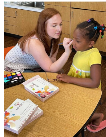
A community grant from the Darke County Foundation supported Healthy Kids Day at the YMCA of Darke County. Local children enjoyed movement activities, wholesome snacks, crafts, and lessons on healthy living.