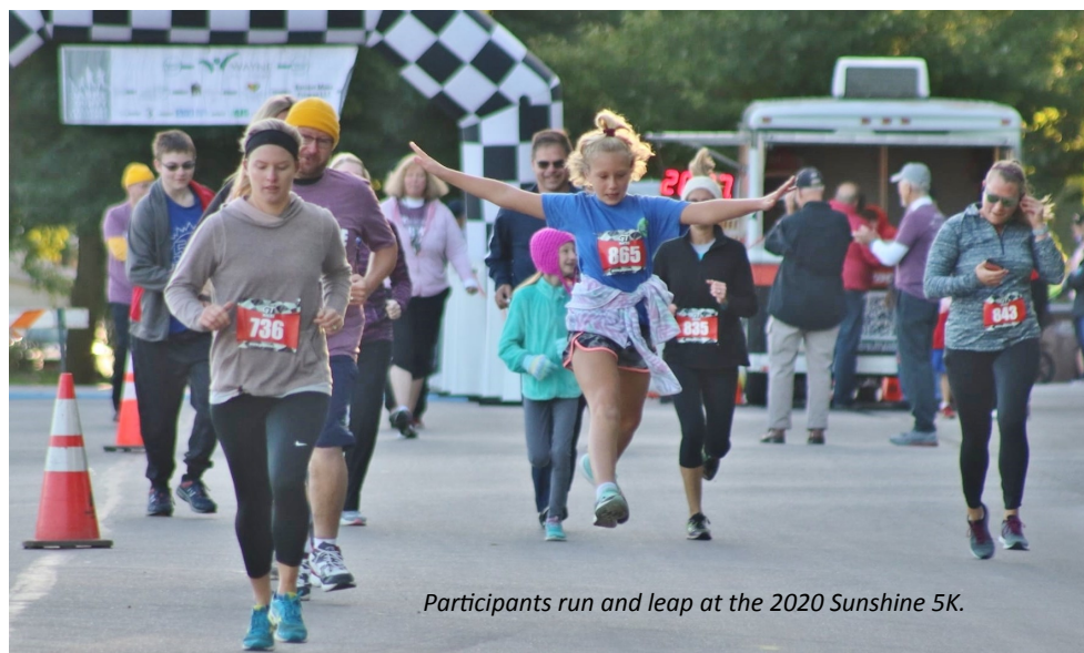
Participants run and leap at the 2020 Sunshine 5K.

ACES School Darke County Humane Society First United Methodist Church St. Paul's Lutheran Cemetery Ansonia Elementary School Darke County Parks Friends of Bear's Mill St. Vincent DePaul Society Arcanum High School Band Darke County Special Olympics Gateway Youth Programs St. Mary's Church and School Big Brothers Big Sisters Darke County United Way Grace Resurrection Center The House that Lulu Built Bradford Middle School Band Darke Co. Christian Education Garst Museum Upper Valley Career Ctr. Aspire Bradford Railroad Museum DeColores Montessori School Greenville Public Library Versailles Schools Special Needs Brethren Retirement Community Empowering Darke Co. Youth Illumination Ministry Versailles Heritage Park Bridges 2 College EUM Church - Next Steps Kinder Korner Preschool Versailles Schools Music Boosters Cancer Assoc. of Darke County EverHeart Hospice Ohio Wave Fastpitch Academy Wayne HealthCare Foundation Coalition for Healthy Darke Co. Financial Asst. for Med. Emergencies Ronald McDonald House Dayton YMCA of Darke County Darke County Center for Arts Final Bow Performing Arts Shelter from Violence YOLO of Darke County