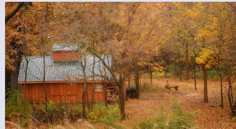
Darke County Parks received a donor-advised grant from the J. Michael Beard Community Fund of the Darke County Foundation..