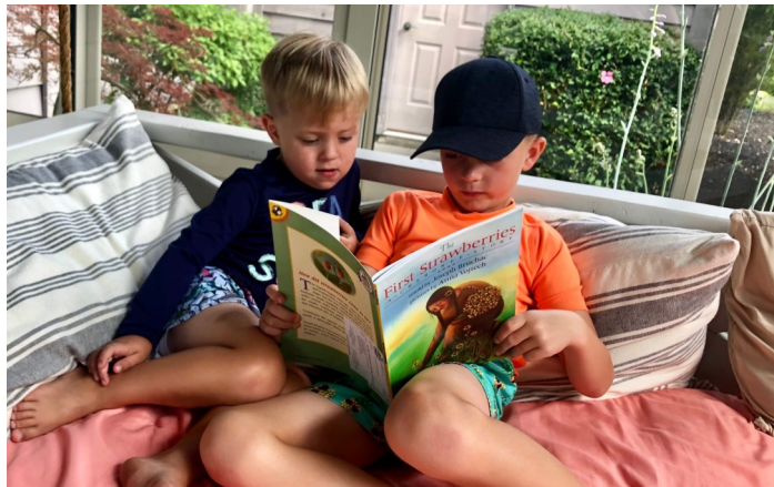
Memorial donations to the Greyson Steyer Fund support grants to programs like the United Way's Dolly Parton Imagination Library that mails monthly books to all Darke County children from birth to age 5.