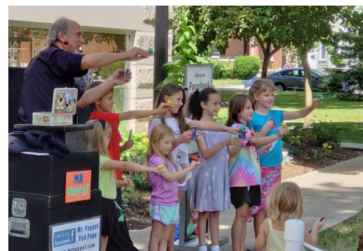
The Greyson Steyer Memorial Fund supports the summer reading program entertainment at Greenville Public Library.