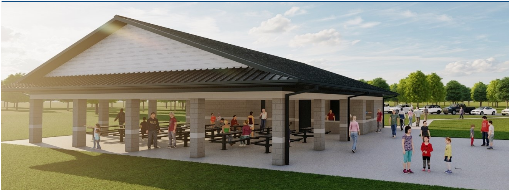
This architectural rendering shows planned improvements at North Star Community Park. The Darke County Foundation is administering the project fund.

The Darke County Foundation is a community foundation dedicated to improving the lives of Darke County residents by receiving, managing and distributing charitable gifts.