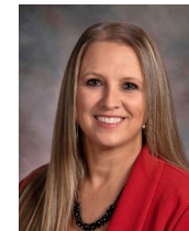
Holly Hill 2017